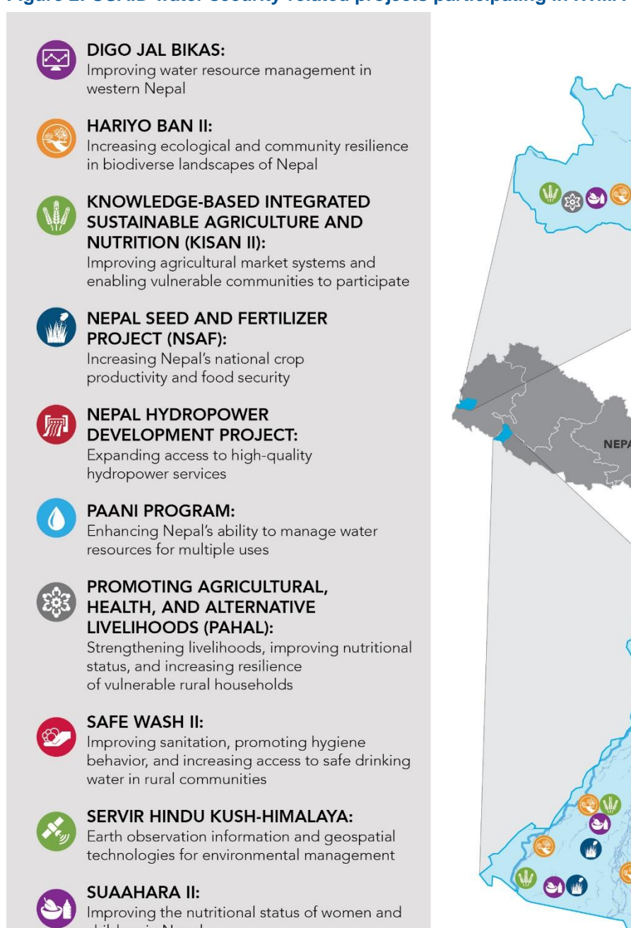
Figure 2: USAID water security-related projects participating in IWMA

LOWER KARNALI WATERSHED children in Nepal The Lower Karnali watershed falls within Surkhet, Bardiya and Kailai districts, covering an area of 875 square kilometers that stretches from the Siwalik ranges to the Terai. The major river flowing through the watershed, the Karnali River, floods frequently and carries a significant sediment load which supports agriculture but can also lead to erosion and flood damage. 34 percent of the land is used for agriculture and nine percent is covered by water bodies. Residents have identified drought, gravel mining, floods, degradation of aquatic habitats, and maintenance of traditional livelihoods as priority issues (Paani 2018).