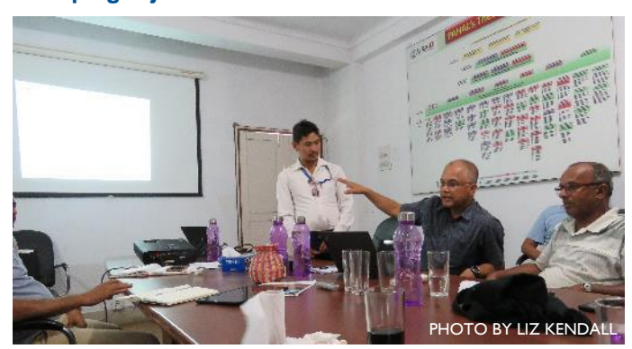
Figure 10: Insurance representative presenting to IPs in Nepalgunj

From June to October 2019, KISAN II conducted 100 trainings, all of which included a session on small water infrastructure insurance, across the 22 districts where the program had constructed and transferred management of small irrigation schemes to Farmer Groups. In total, 1,878 farmers (1,313 female, 565 male) received information about how to insure their new or renovated irrigation schemes.