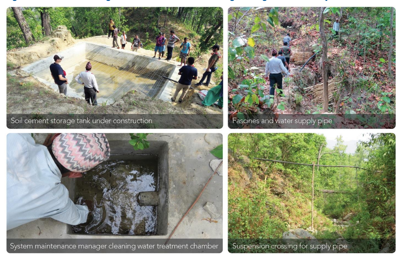
Figure 6: Milan Debari irrigation infrastructure and bioengineering constructed by PAHAL

with the local government and debriefed Ward 9 officials about the integration activity. After considering the opportunity, the Ward contributed 2,00,000 NPR ($1,765) in matching funds for the construction of the Milan Debari Irrigation Scheme. In addition to the Ward, the community provided labor and contributed 6,22,150 NPR ($5,492).