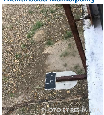
Figure 11: FEWS gauge on the Aurahi Khola River, Thakurbaba Municipality

Municipality (January 6-7, 2020) and Thakurbaba Municipality (January 8-9, 2020). Each event lasted two days, trained a combined 76 participants on CCA, DRR, and EWS, and produced an action plan for Madhuwan and Thakurbaba Municipalities. In Madhuwan Municipality, there were 35 participants (19 female, 61 male) from Ward I, which is a high-risk flood zone. There were 47 participants (27 female, 20 male) from Wards I and 9 of Thakurbaba Municipality, also high-risk flood zones. In addition to educating participants on pre-disaster preparedness and mitigating climate risks and vulnerabilities, these events supported the municipality's Master Plan.