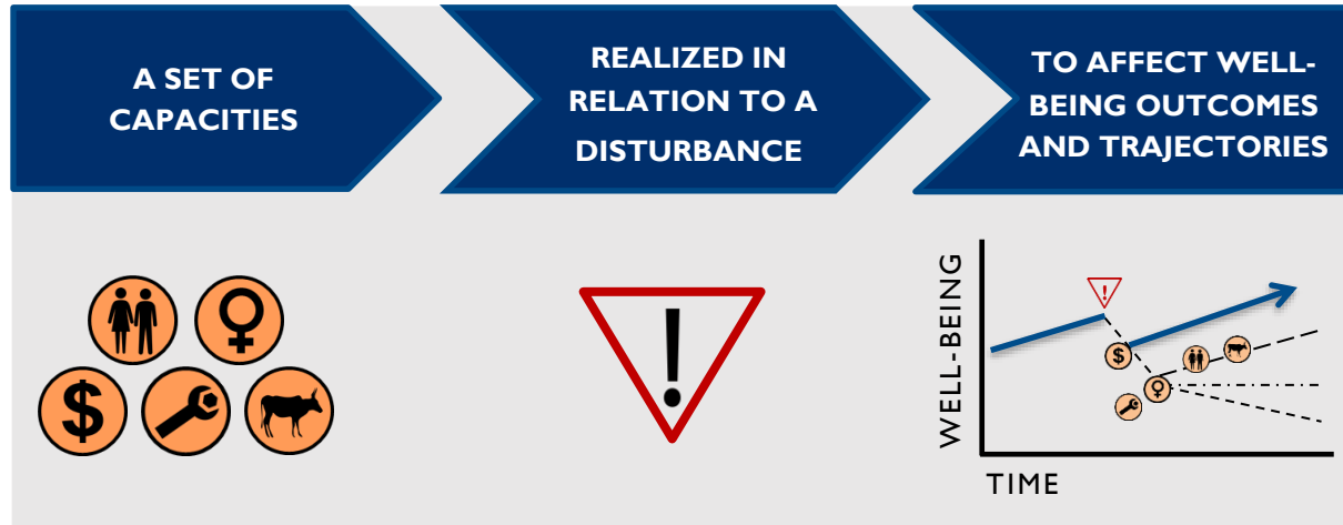
Figure 1: Simplified Resilience Measurement Framework.

Figure 1, adapted from Mercy Corps' resilience framework, illustrates how resilience capacities, when measured in connection with a shock or stress, can help us understand programs' impacts upon development and well-being outcomes. 4