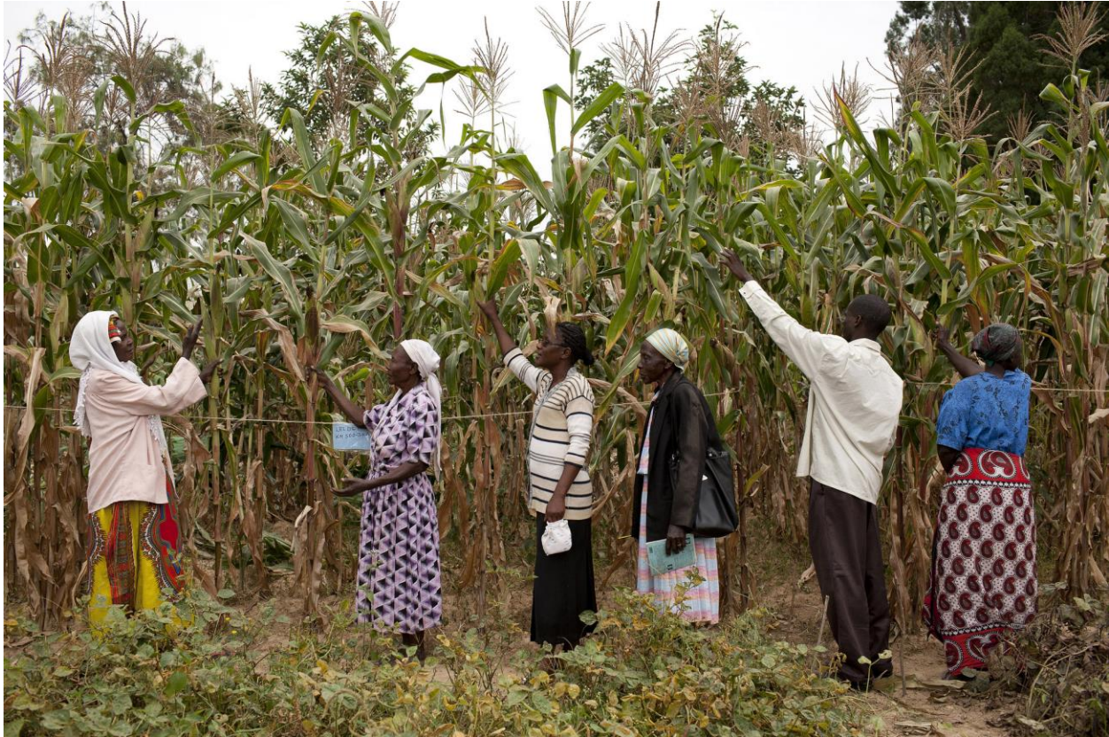
Field-level assessment in Kenya.

Conducting a risk and resilience assessment is a powerful capacity building and relationship building process; the process often holds as much value in itself as the results it produces. Ensuring and encouraging the active participation of a diverse set of partners and teams is key to enhancing learning. Doing so can enable each participant to confront the complexity of their working context and better understand how their contributions to increased resilience capacity can connect their work to achieving broader development goals.